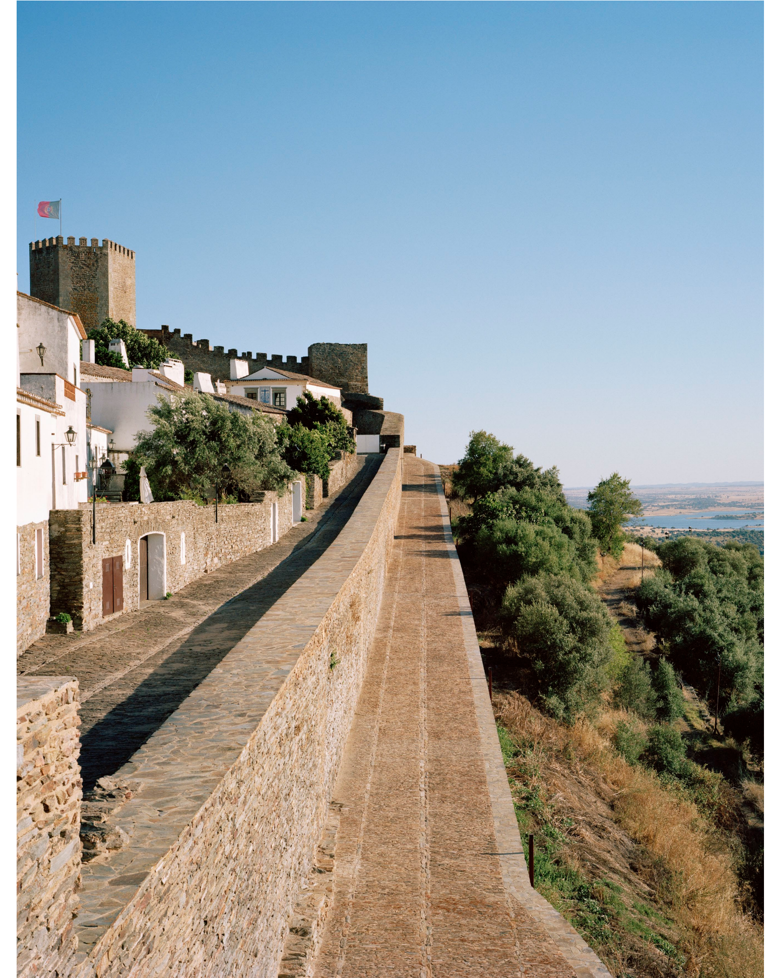
Barbican Path. 2021 @