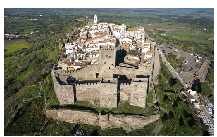
Panoramic View Previous to Project. South Bastion. 2016

Archaeological monitoring allowed a more rigorous definition of the different design interventions, which consists on walls restauration, new shist pavements and new granite stairs. Corten steel appears as a new material for elements outside the wall perimeter, such as stairs and lampposts. This work aims to preserve the authenticity of places, its historical continuity and architectural landscape identity.