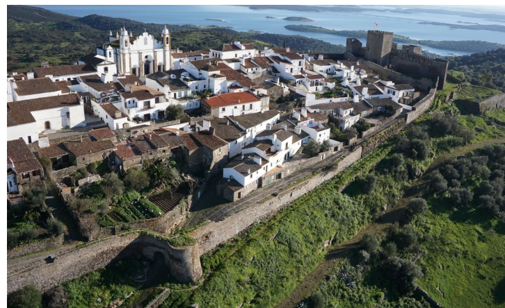
Panoramic View Previous to Project Barbican Path 2016 © 76

Complementarity and continuity are the key ideas of the intervention. Understanding this project and place not only as an intervention in historical heritage, but rather as a landscape project, which seeks a more intense and effective relationship with the entire territory of Monsaraz, underlining its landmark condition.